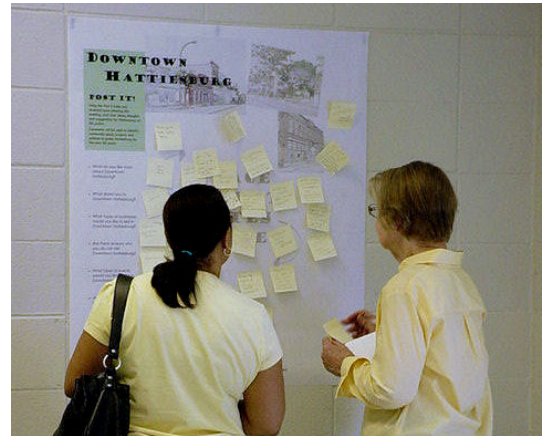
City residents submit comments at the comprehensive plan kick-off event at the W. U. Sigler Center.

After the Consolidated Plan hearings, the consultant planners provided information on the comprehensive