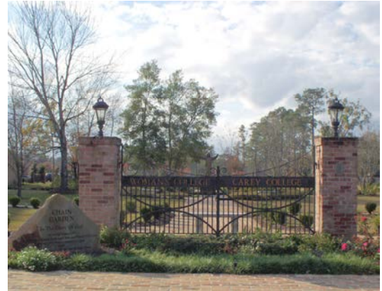
Photo: Chain Garden, William Carey University.

A neighborhood visioning workshop for the University of Southern Mississippi/Forrest General Hospital District was held October 25, 2006. The visioning