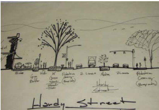
Photo: Recommendation for new Hardy Street streetscape design presented at visioning session.

workshop was a pre-conference event for the 2006 meeting of the Mississippi Chapter of the American Planning Association (MAPA). The focus of the event was to explore ideas and gather input on possible land use, streetscape design, and development options for an area surrounded by the University of Southern Mississippi, Forrest General Hospital and the University Heights neighborhood.