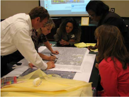
Photo: Participants discuss plan options at the visioning session sponsored by the Mississippi Chapter of the American Planning Association.