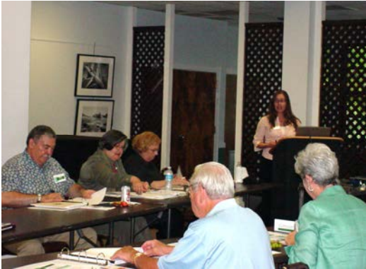
Photo: Vision Advisory Team meeting.