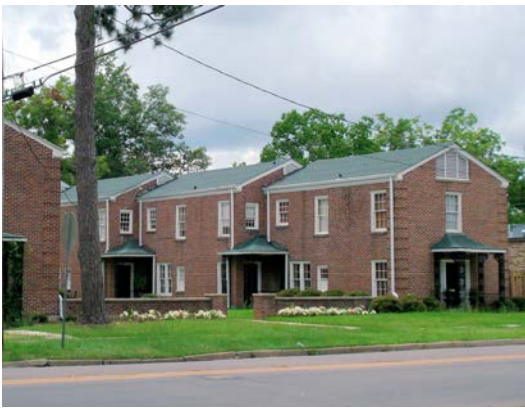
Photo: Townhouses on Second Avenue.