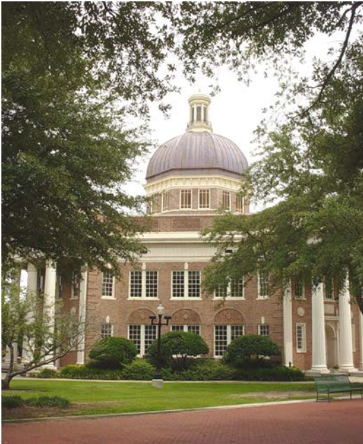
Photo: University of Southern Mississippi's Administration Building.