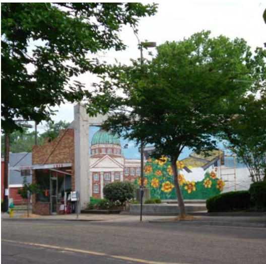
Photo: Mural on Coney Island building in Downtown Hattiesburg.